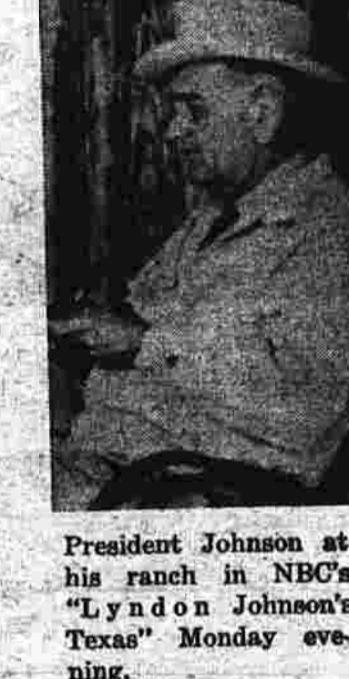
President Johnson at his ranch in NBC's "Lyndon Johnson's Texas" Monday evening.